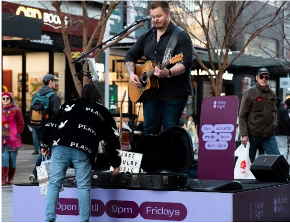
Rundle Mall Activations

A range of activations have been delivered in the Rundle Mall precinct increasing vibrancy and driving foot traffic and spend, including: