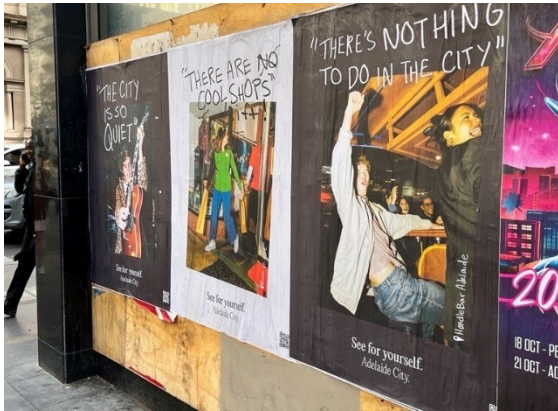
See for Yourself Campaign

The 'See for Yourself' campaign targeted at 22–49 year olds across Adelaide, challenged perceptions that the city is 'bland, boring and sleepy', particularly in winter. The campaign was in market from June to July to coincide with traditionally quieter period for city visitation and targets an audience that research shows has the desire and disposable income to enable them to experience the city. The campaign profiled over 115 business and generated 11,900+ visits to the SeeADL.com.au landing page, converting to 2,465 leads for city operators. The paid advertising resulted in a reach of 4.7m impressions (how many times an ad is viewed by users).