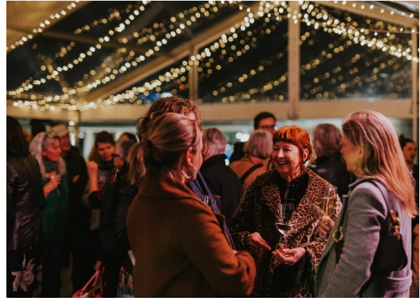
Sponsored Events and Festivals

Fruhoc Appreciation Day held on 27 September in Rundle Mall was a day where South Australians could gather together to celebrate the apricot and chocolate icon. Free activities included face painters, music, photobooth, games and giveaways.