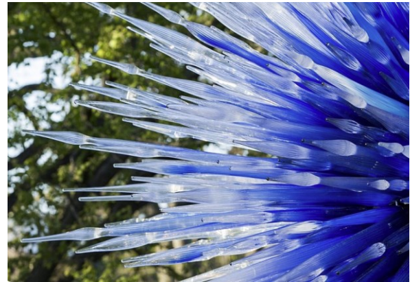
Chihuly City Trail

*Average refers to the SATC benchmark, based on a database of SATC ads tested since 2015